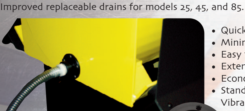
Quick to change