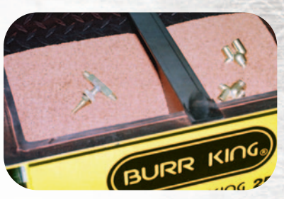
All Vibra King Chambers accept one to four dividers.