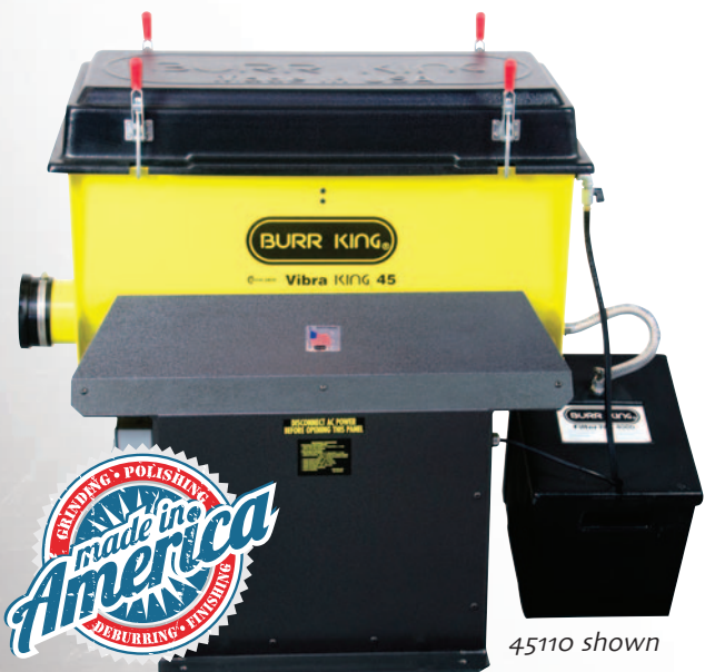
Capacity 2.5, 4.5 and 8.5 cubic feet

Optional process timers may be added to the M25, M45, and M85. These timers permit precise process timing control to manage critical finishes and economize valuable shop time. Process timers include high quality magnetic starter contactors.