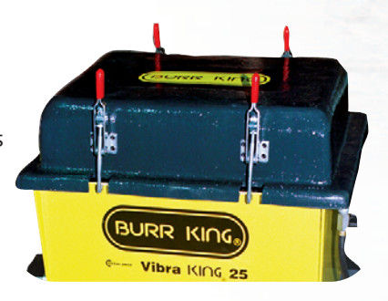
All Vibra King Chambers accept optional Vibra Hush lids reducing sound emission 3 to 6 db.

Shown with FilterPAK 4001 and 3387 sound dampening lid.