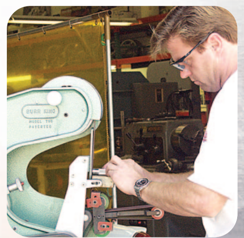
Custom Car Fabrication