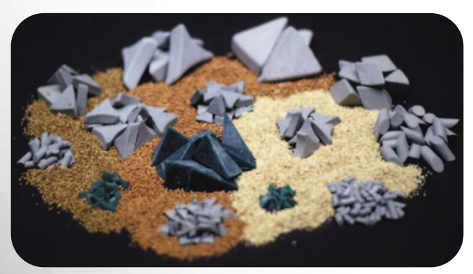
Note: You can request our separate media sheet

Various media is available for processing ferrous, non-ferrous, plastics, and other materials. Finishes from sparkling clear to matte are possible with the proper selection of media and compounds. Specialty medias include ceramic, synthetic, plastics, cobs, shells, etc. Consult with the factory for the best media for your application.