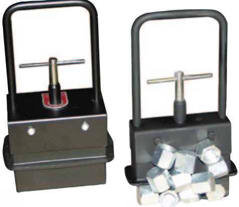
Magnets for retrieving small ferrous metal parts from media

Media/Parts Separating Screens and container