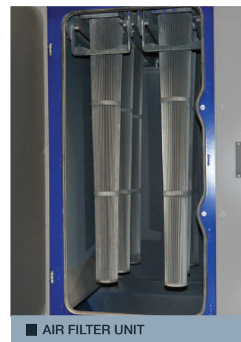
■ AIR FILTER UNIT