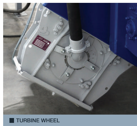
■ TURBINE WHEEL

Just switch on the roller conveyor and a PLC takes over the entire process, monitors the material transfer speed, automatically starts the abrasive recycling system, and starts the blast wheels sequentially one at a time as the profile arrives inside the blast chamber. When the leading edge of the profile leaves the blast area, the blow-off motor starts automatically and removes residual shot from all surfaces. As the trailing end of the profile leaves the chamber, the whole system shuts down in sequence, thus eliminating wasted power, saving you money