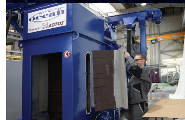
■ SIMPLE MODULAR GASKET