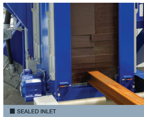
■ SEALED INLET