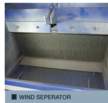
■ WIND SEPERATOR