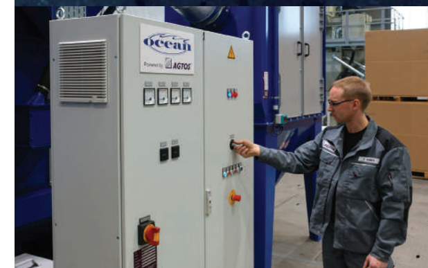
■ CONTROL CABINET