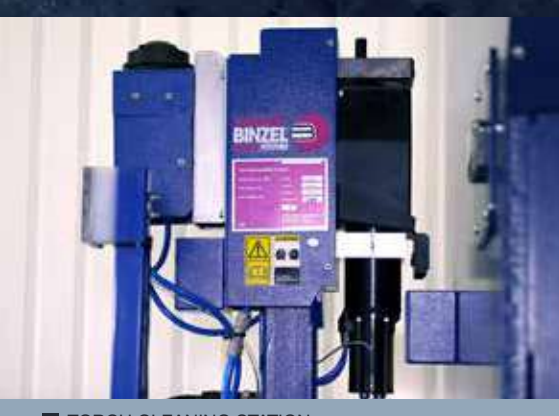
■ TORCH CLEANING STATION