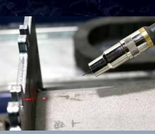
■ LASER TOUCH SENSING OF PART TO BE WELDED