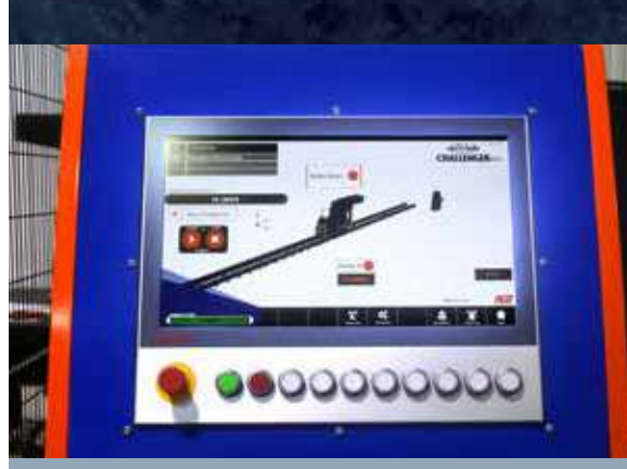
■ EASY-TO-USE GRAPHIC INTERFACE