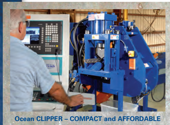
Ocean CLIPPER - COMPACT and AFFORDABLE

The Ocean CLIPPER is the most economical CNC clip angle line in the world. Similar machines are out of the reach of most small to medium fabricators, but the Ocean CLIPPER is extremely affordable. The fabricator only needs to run his machine a couple of hours each day and it will pay for itself in less than 12 months.