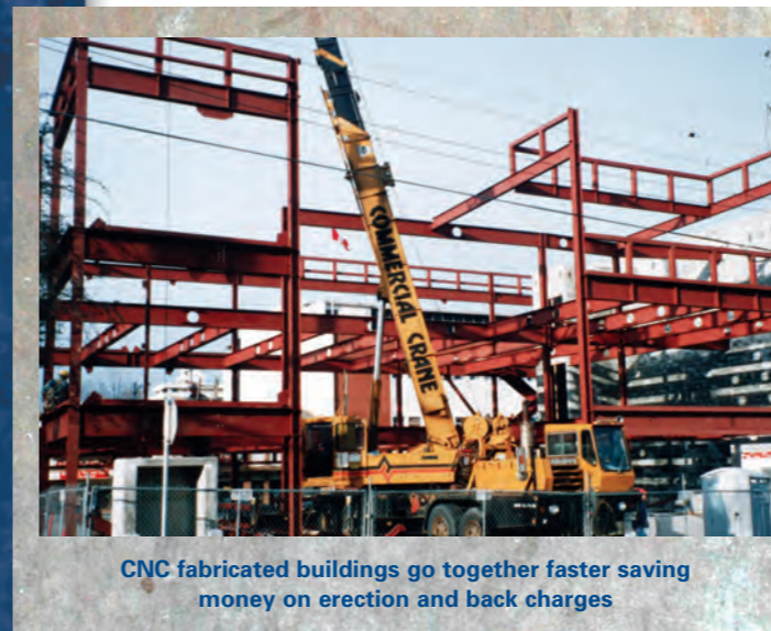
CNC fabricated buildings go together faster saving money on erection and back charges

So the end result is a highly accurate, very efficient and very affordable CNC angle line.