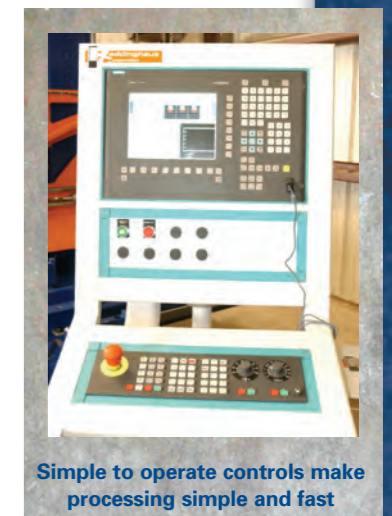
Simple to operate controls make processing simple and fast

The Clipper can be hardwired to your local network for easy access and importing of your detailing files.