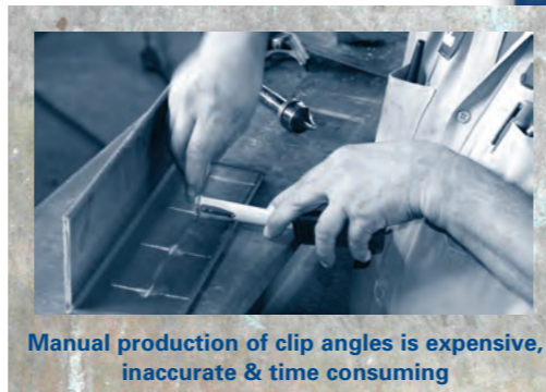
Manual production of clip angles is expensive, inaccurate & time consuming

And while many fabricators wanted a CNC angle line to speed up the process and reduce the costs, they seldom could afford to buy one.